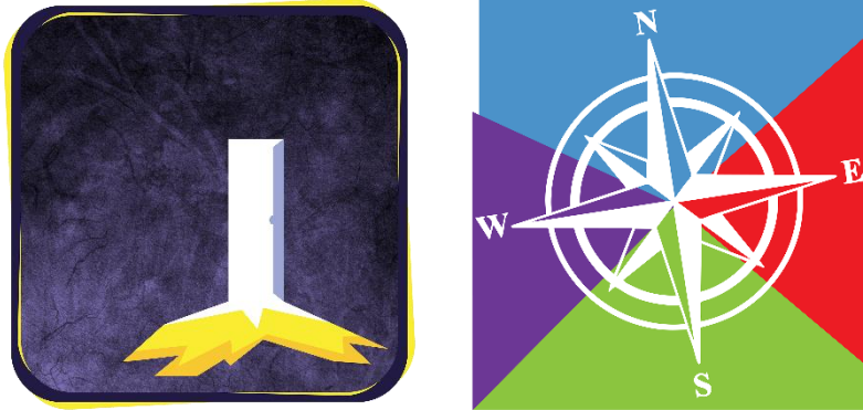
The Open Door